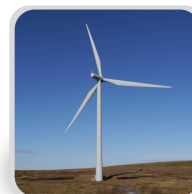
Onshore Wind Farms