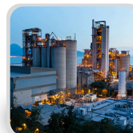
Petrochemicals & Pharmaceuticals