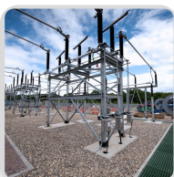
Transmission & Distribution

Working to all relevant industry standards and guidelines (such as BS 7430, BS EN 50522 , and Technical Specification 41-24 ) the EPS team supports a wide range of industries and sectors, including: