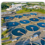
Water & Wastewater