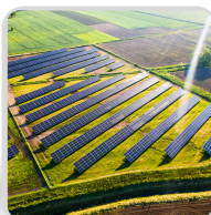
Solar PV Farms