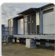
Battery Energy Storage Systems