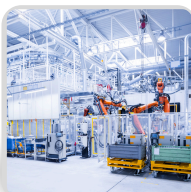
Manufacturing & Process